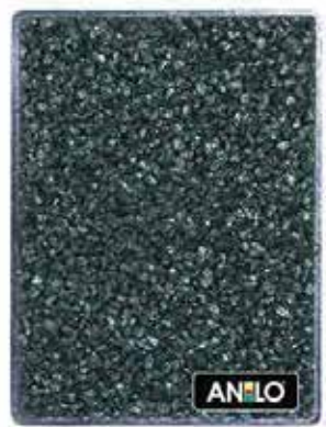
ANL2674 1.5/2.5 mm