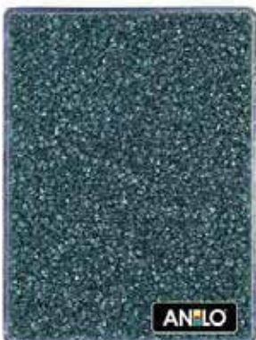
ANL2671 0.8/1.2 mm