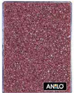
ANL2670 0.8/1.2 mm