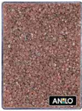
ANL2680 1.5/2.5 mm