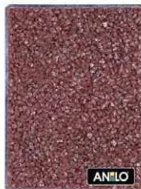
ANL2675 0.8/1.2 mm