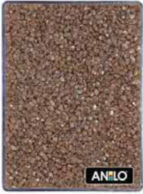
ANL2676 1.5/2.5 mm