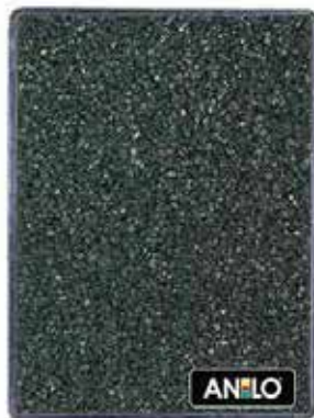
ANL2668 0.8/1.2 mm