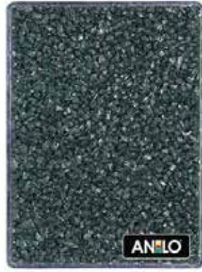
ANL2677 1.5/2.5 mm