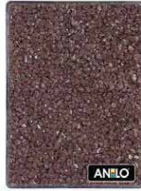
ANL2678 1.5/2.5 mm