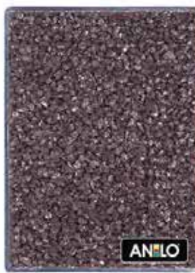
ANL2673 1.5/2.5 mm