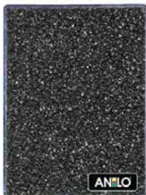
ANL2672 0.8/1.2 mm