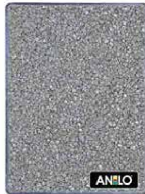
ANL2669 0.8/1.2 mm