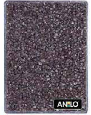
ANL2679 1.5/2.5 mm