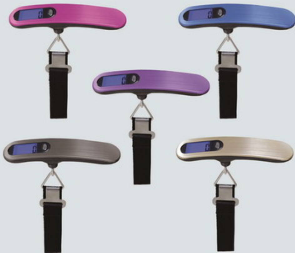
Model No.: LS022R/LS022C

High precision strain gauge sensors system Max capacity/Division: 50kg/10g Unit: g, oz, kg, lb Stainless steel front cover or colorful aluminium Bigger LCD display size: 30x18mm With blue backlit Auto zero/auto off Data lock, convenient to read Overload and low battery indication Tare function Power: 1x3V CR2032 lithium battery