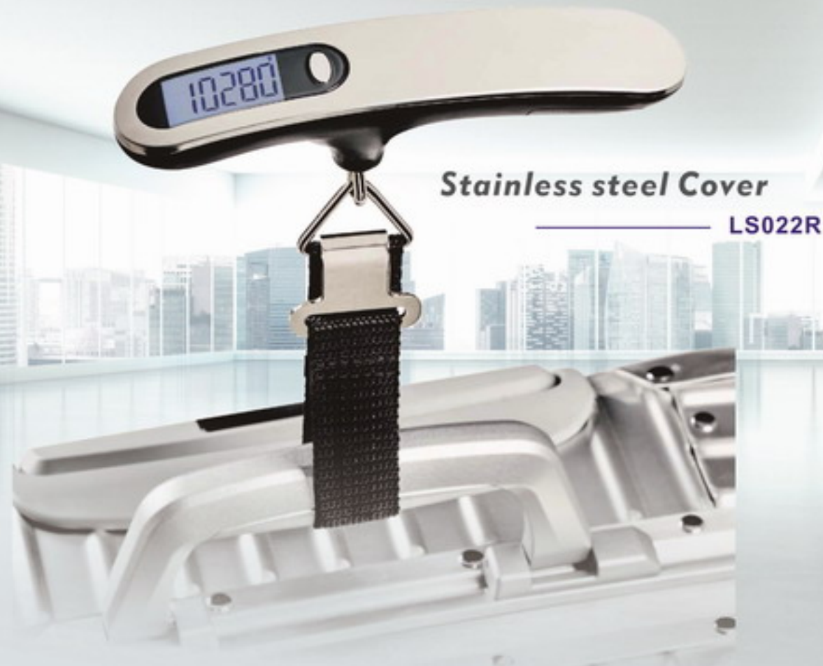
Stainless steel Cover LS022R